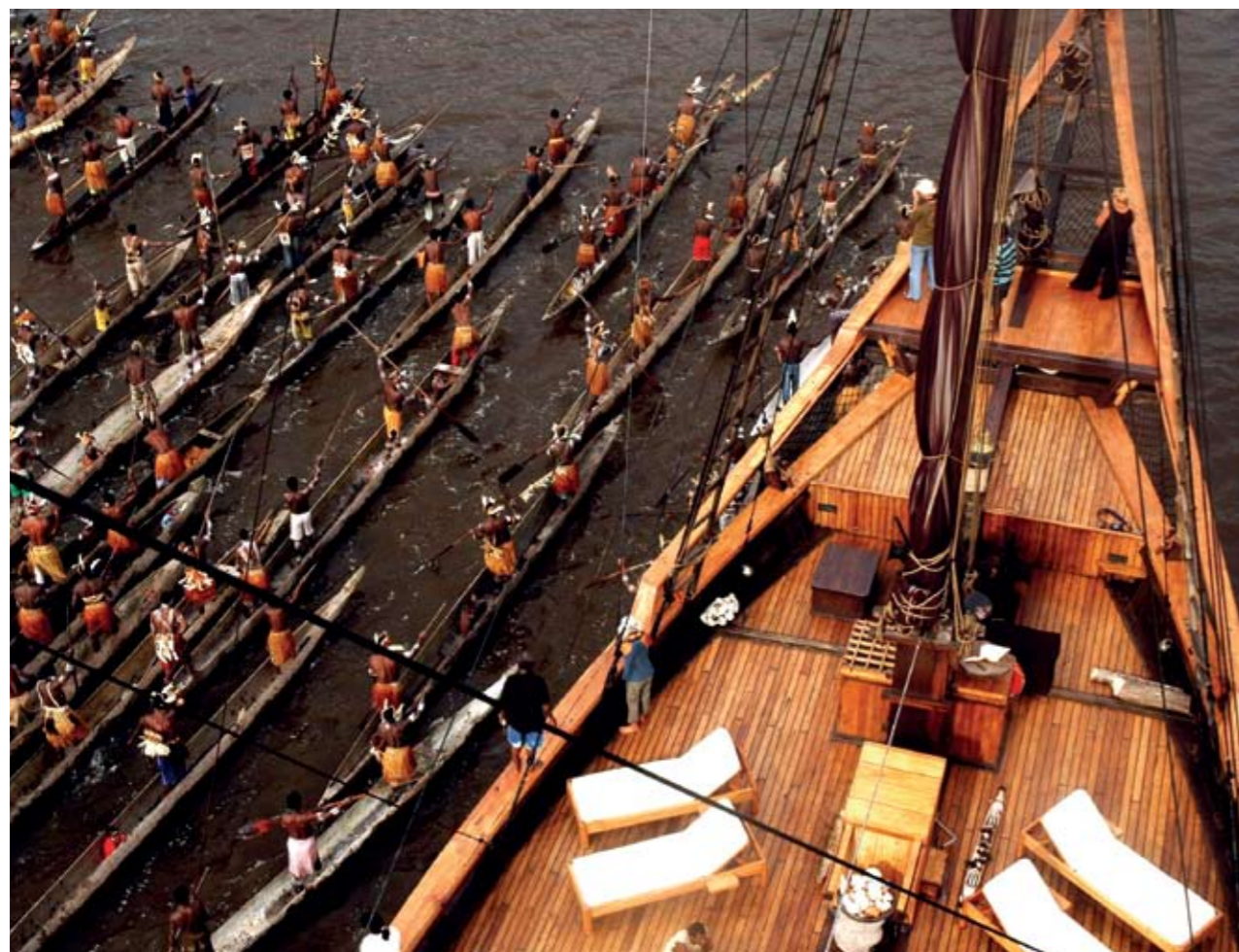
Opposite: The cinnamon-hued sails and off-white hull make a beautiful contrast (top left); the Afternoon deck allows guests to enjoy the scenery (top right); one of the three suites aboard the Silolona (centre) and the Silolona-Papua-Asmat pulls up alongside the longboats of the local Indonesian tribesmen (above);

The Konjos who live in the towns of Ara, Bira and Tanah Biru on the southern tip of South Sulawesi build boats according to techniques that date back to the 1500s. Made of teak, ironwood, and other local hardwoods, the vessels are collectively called phinisi—referring to the traditional rig type—and commonly described as a seven-sail schooner. This type of boat is associated with the seafaring Bugis people who have used them to transport passengers and cargo over the past centuries.